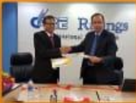
Vidyasaarathi scholarship scheme launched at Care Rating Limited, Mumbai