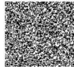
E-Invoice QR Code

Dear Customer, Income Tax Department, Govt of India has granted certificate no. 197(1)/AABC85576G/2022-23/1 Dt 22/06/2022 (can be downloaded from https://bsnl.co.in/opencms/bsnl/BSNL/about_us/pdf/Certificate_197AABC_2022.pdf ) to BSNL relating to TDS at lower rates applicable from 22/06/2022 to 31/03/2023. TDS may be recovered at the lower rates mentioned in the certificate issued by Income Tax Department.